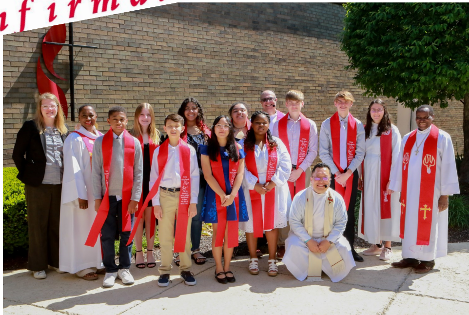
2023 Lake South District Confirmation Class May 21, 2023